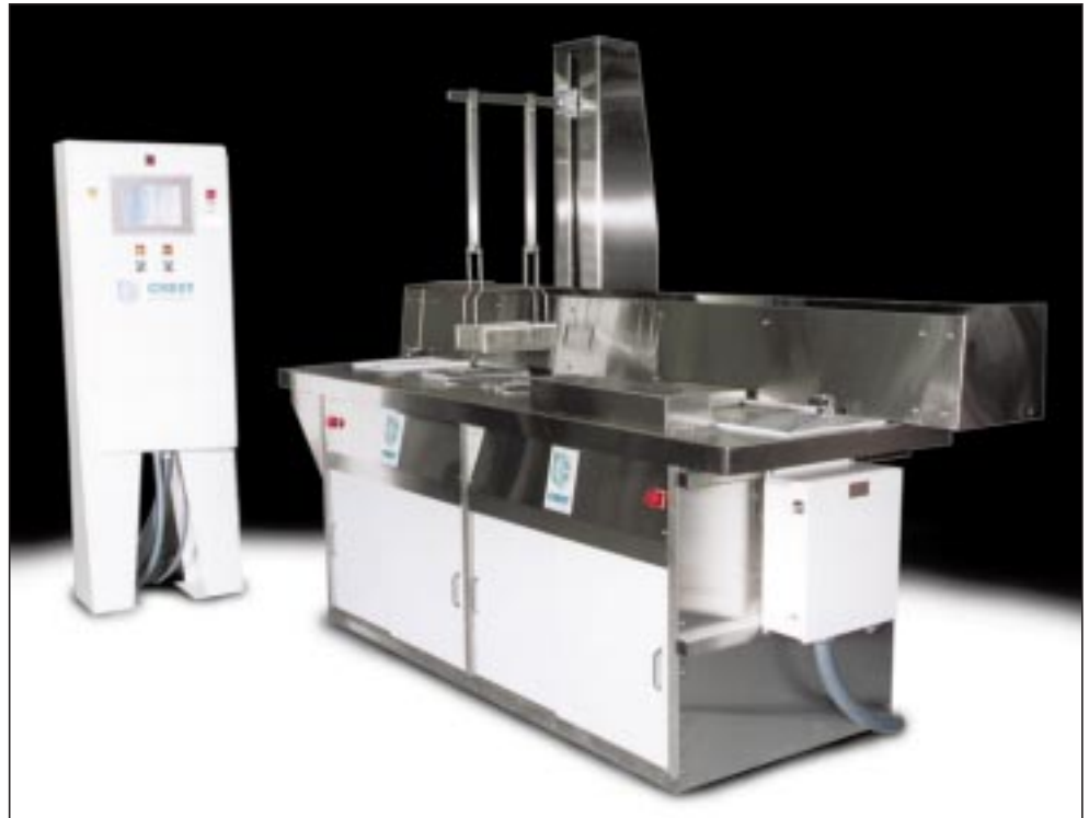
Optimum Console™ precision ultrasonic cleaning system shown with CTS-250 Automated Transport System.

PLC controlled two-axis Automation system with user-friendly graphical color touch screen operator interface can be field-mounted to existing cleaning benches or supplied with new systems. The PLC controls all process parameters and functions, tracks work through multiple process programs and can provide critical process data for offline analysis. The CTS-250 has a 25lb. lifting capacity and is cleanroom compatible.